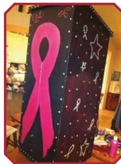
Our podium was spiffed up and used at the Sunrise for the Breast Cancer Fundraiser on October 9th

Regular Tickets: $15.00 • Box Office: 772 465-0366