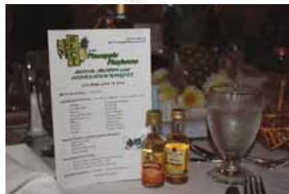
The banquet invite/set up